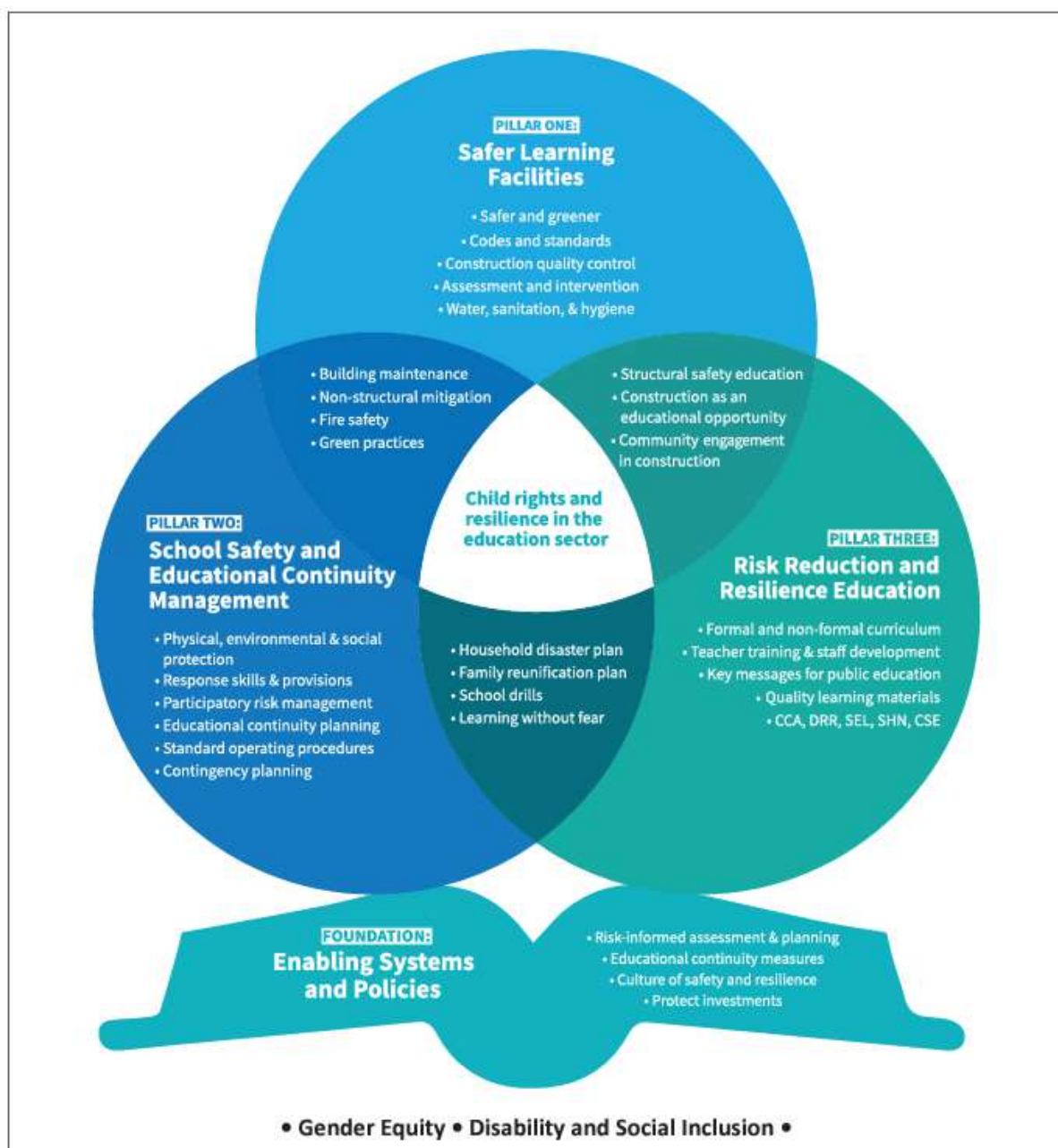
Figure 2: Comprehensive School Safety Framework 2022-2030 41

These three pillars form the foundation of the report's research findings. Pillar One on 'Safer learning facilities' signifies how schools are directly affected by climate change. This is explored in Section 4.1, in terms of how extreme weather is causing immediate barriers to school attendance or difficulties in learning.