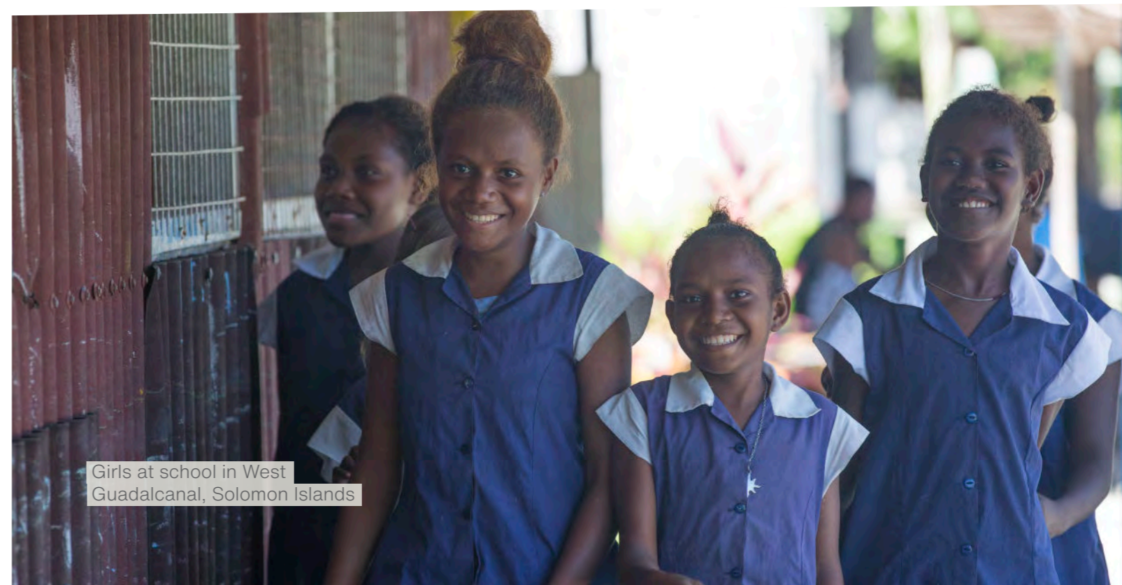
Girls at school in West Guadalcanal, Solomon Islands