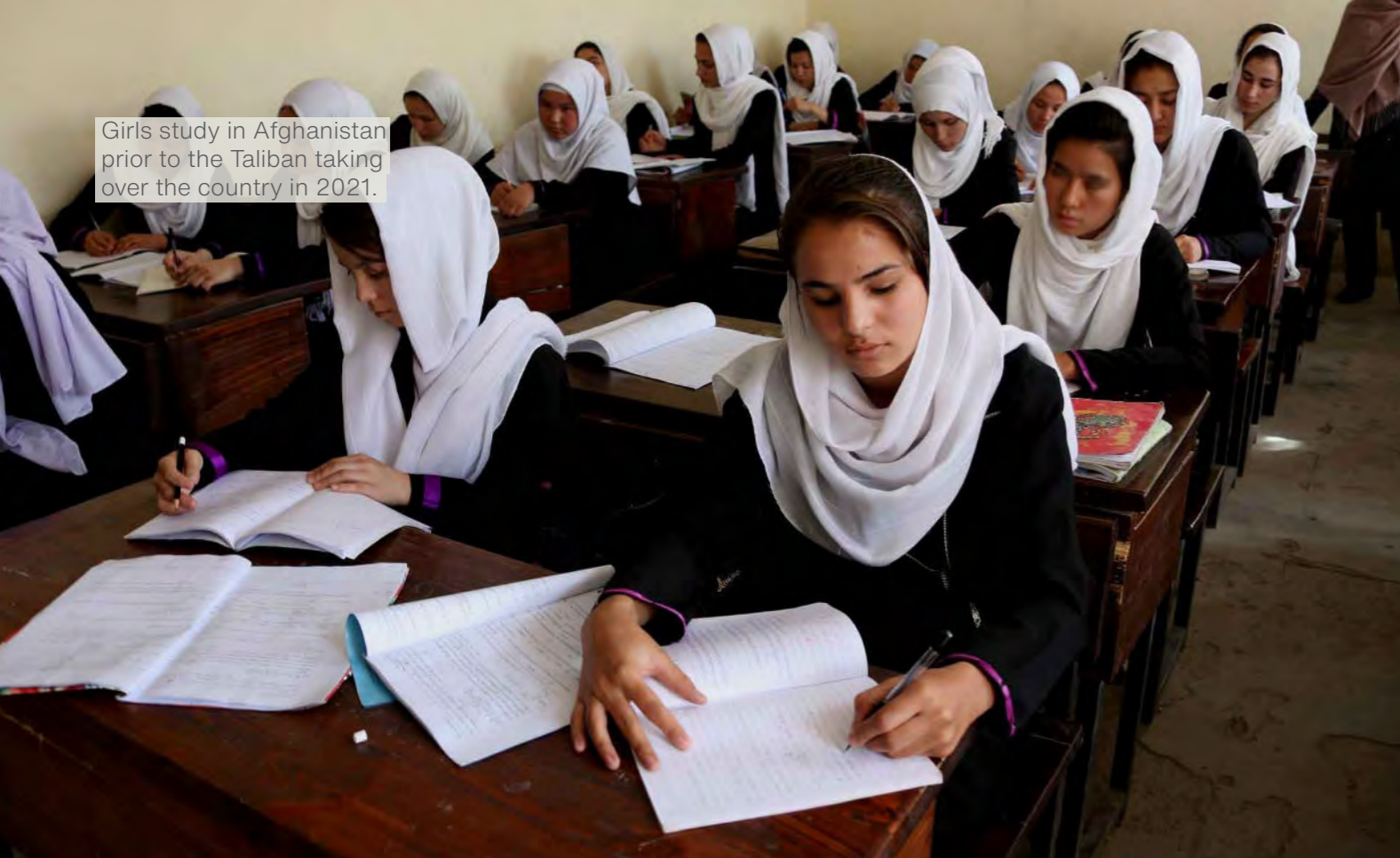
Girls study in Afghanistan prior to the Taliban taking over the country in 2021.