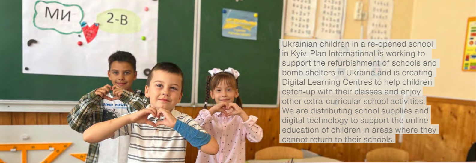
Ukrainian children in a re-opened school in Kyiv. Plan International is working to support the refurbishment of schools and bomb shelters in Ukraine and is creating Digital Learning Centres to help children catch-up with their classes and enjoy other extra-curricular school activities. We are distributing school supplies and digital technology to support the online education of children in areas where they cannot return to their schools.

Education is a catalytic investment when it comes to alleviating poverty. For children affected by crises, it is even more important, providing protection, normalcy and a sense of hope for their futures.