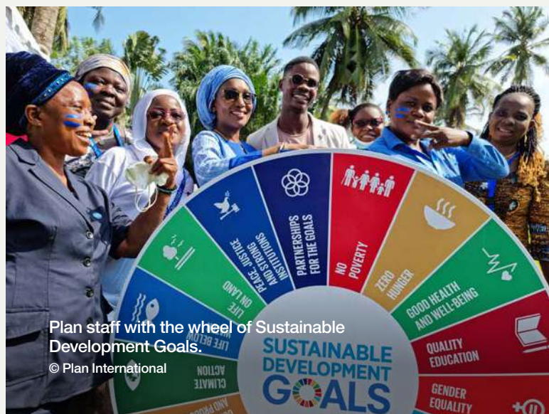
Plan staff with the wheel of Sustainable Development Goals.

Significantly, some activists and many of their audiences, had not even heard of the SDGs which points to a need for better communication and a more targeted understanding between international policy makers and grassroots communities. With this in place, the campaigning energy and commitment of young women activists could be crucial in driving the SDG agenda.