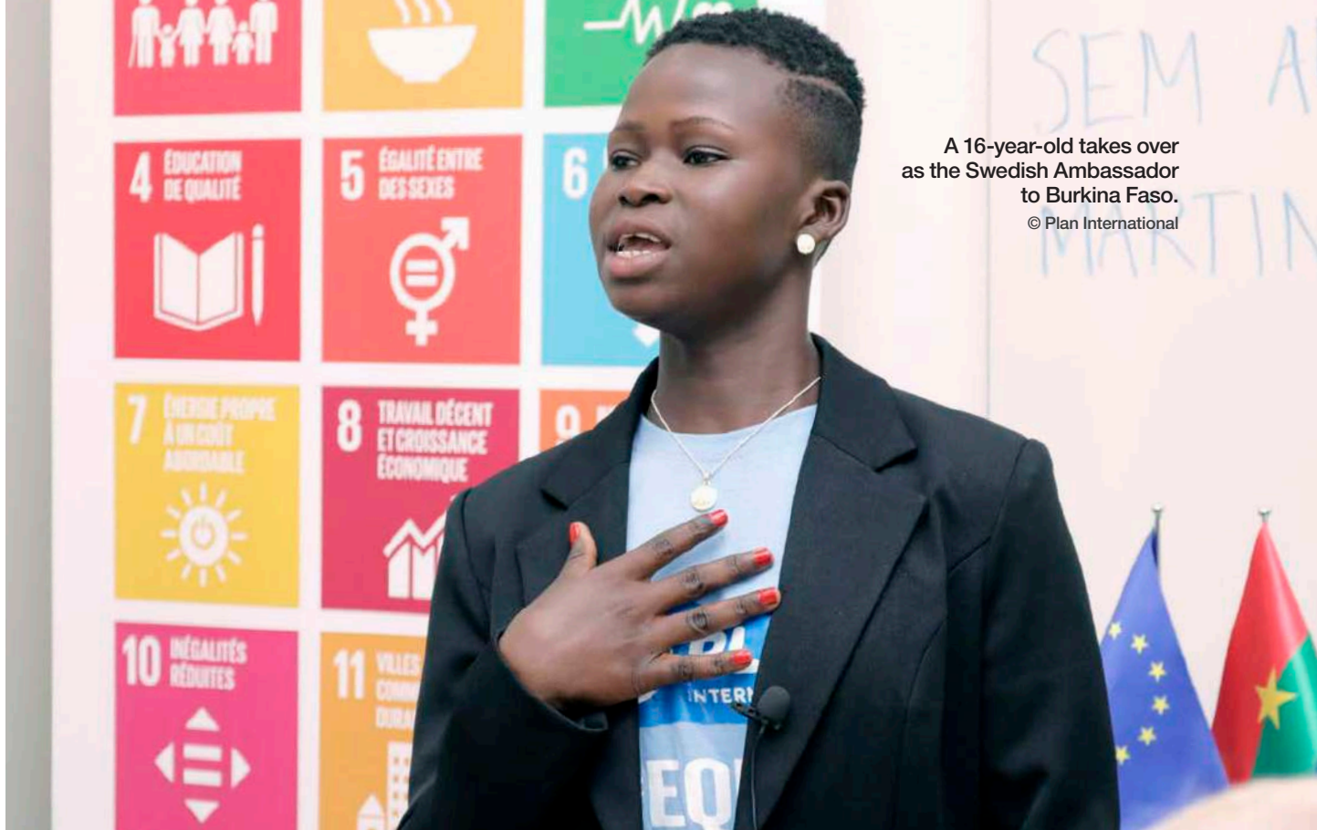
A 16-year-old takes over as the Swedish Ambassador to Burkina Faso.